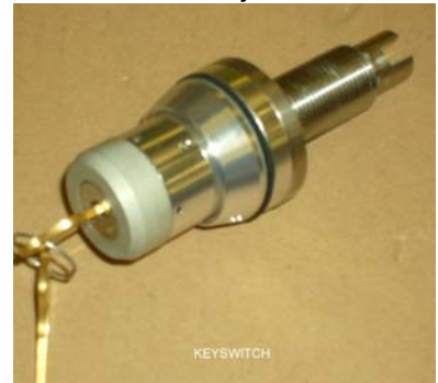
KS - Keyswitch