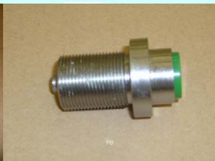
PB – Push Button