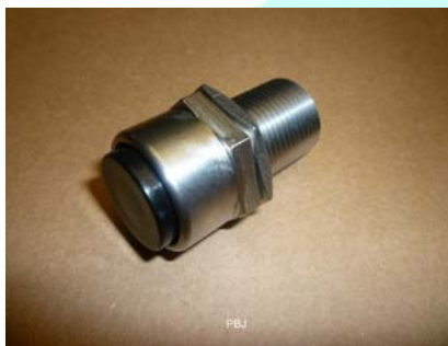
PBJ – Push Button