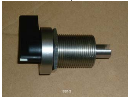
SS1 – Rotary Switch