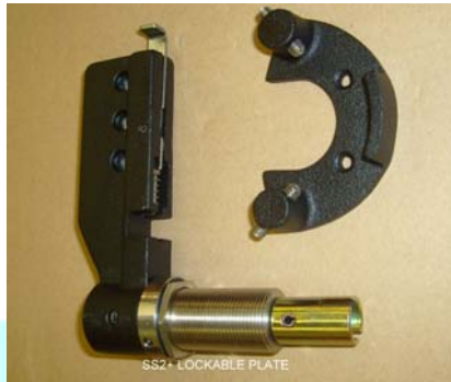
SS2 – Lockout Switch